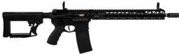
P3 AR-15 .223 Wylde Mid Length Adjustable Gas Piston 16" PROOF Research Carbon BRL w/ AARS M-LOK Rail System & Jet Comp Muzzle Brake

The Adams Arms P3 is the match-grade performance model in the P-Series lineup. The P3 features a jet comp, an ergonomic free float rail, and our signature P-Series Micro Block piston system. This rifle is designed for avid shooters with its ambidextrous safety selector and charging handle. The P3 includes a flat-faced CMC trigger, a rubber ergonomic grip, and an adjustable LUTH AR stock with cheek riser. This high-performance rifle is ready to compete. The P3 is available in 16" .223 Wylde, 12.5" 300BLK, 20" .224 Valkyrie, 17" .308, and 24" 6.5CM.