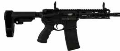
P2 AR-15 300 AAC Blackout Pistol Length Adjustable Gas Piston 8" BRL w/ AARS M-LOK Rail System & A2 Flash Hider