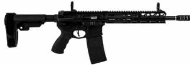
P3 AR-15 300 AAC Blackout Pistol Length Adjustable Gas Piston 12.5" PROOF Research Carbon BRL w/ AARS M-LOK Rail System & Jet Comp Muzzle Brake