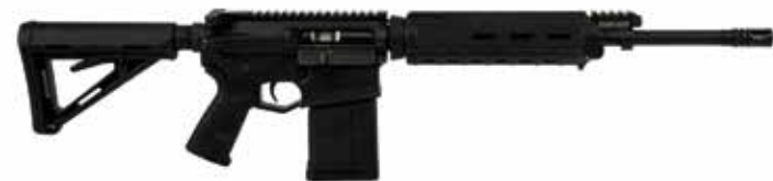
P1 MOE Small Frame Semi-Auto .308 WIN Mid Length Adjustable Gas Piston 16" BRL w/ Magpul MOE Furniture & A2 Flash Hider