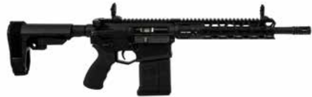
P2 Small Frame Semi-Auto .308 WIN Carbine Length 12.5" BRL w/ AARS M-LOK Rail System & A2 Flash Hider