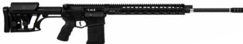
P3 Small Frame Semi-Auto 6.5 Creedmoor Rifle Length +2" Adjustable Gas Piston 24" BRL w/ AARS M-LOK Rail System & Jet Comp Muzzle Brake