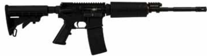
P1 AR-15 5.56x45mm NATO Carbine Adjustable Gas Piston 16" BRL w/ M4 Hand Guard & A2 Flash Hider