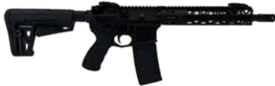
P2 AR-15 5.56x45mm NATO Carbine Adjustable Gas Piston 11.5" BRL w/ AARS M-LOK Rail System & A2 Flash Hider

Adams Arms provides the highest quality, most dependable, and most reliable firearms to Military, Law Enforcement, and First Responders. For government and agency purchases, please email sales@adamsarms.net .