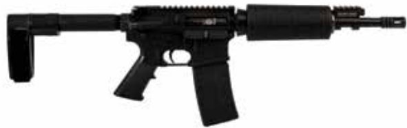
P1 AR-15 5.56x45mm NATO Carbine Adjustable Gas Piston 11.5" BRL w/ M4 Hand Guard

The Adams Arms P1 is the anchor of the P-Series. The P1 model is built with the Standard Picatinny Adjustable Block piston system, a M4 style stock, an A2 grip, and a standard trigger guard. The P1 MOE model includes Magpul MOE handguards, stock, and grip, with the Standard Picatinny Adjustable Gas Block piston system. The P1 and P1 MOE are perfect for anyone looking for a self-cleaning, piston driven rifle that provides superior performance. The P1 model is available in 11.5" and 16" 5.56 and the P1 MOE is available in 16" 5.56 & .308.