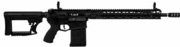
P3 Small Frame Semi-Auto .308 WIN Int. Length Adjustable Gas Piston 17" PROOF Research Carbon BRL w/ AARS M-LOK Rail System & Jet Comp Muzzle Brake