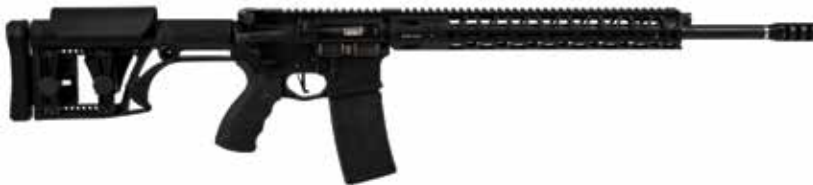
P3 AR-15 .224 Valkyrie Rifle Length +1" Adjustable Gas Piston 20" PROOF Research Carbon BRL w/ AARS M-LOK Rail System & Jet Comp Muzzle Brake