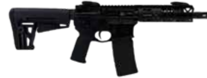
P2 AR-15 5.56x45mm NATO Pistol Length Adjustable Gas Piston 7.5" BRL w/ AARS M-LOK Rail System & A2 Flash Hider