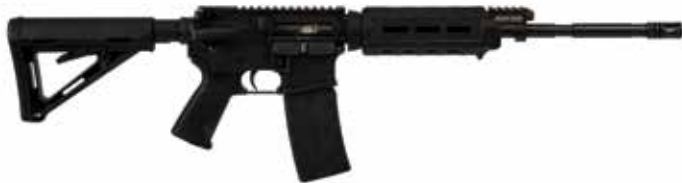
P1 MOE AR-15 5.56x45mm NATO Carbine Adjustable Gas Piston 16" BRL w/ Magpul MOE Furniture & A2 Flash Hider